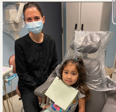
Crossover Dental Clinic Richmond, VA