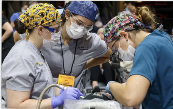
Wise, VA - Mission of Mercy 2023